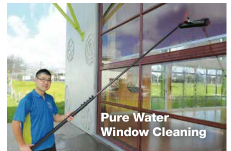
Pure Water Window Cleaning