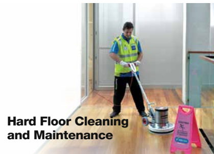
Hard Floor Cleaning and Maintenance