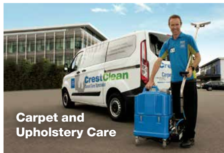
Carpet and Upholstery Care

We can make a real difference to the presentation of your premises.