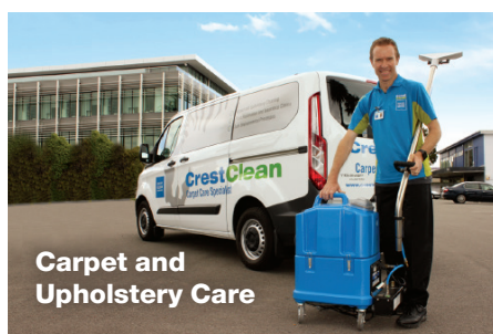
Carpet and Upholstery Care

We can make a real difference to the presentation of your premises.