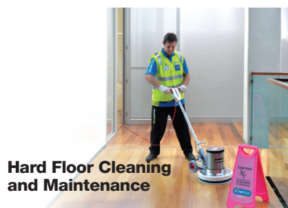
Hard Floor Cleaning and Maintenance