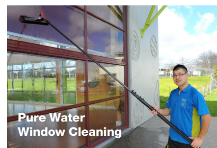
Pure Water Window Cleaning